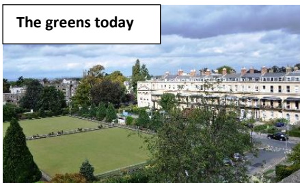
The greens today

To celebrate this Centenary Year, the Club held a Gala Dinner at the Queens Hotel in January (a location synonymous with the club's previous location), hosted a match against Bowls England in May and plan a Centenary Tour to Torquay in September.