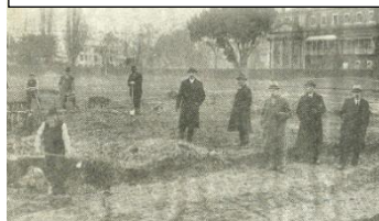
First green being laid in 1917

From the first time a bowl was bowled at Suffolk Square at 5pm on Saturday 11 May 1918 the club has evolved to become one of the major clubs in the county, having excellent facilities, a stable membership and a continuing crop of good club, county and international players.